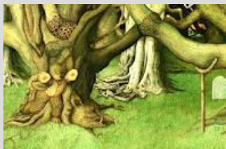
A quiet wood

What sort of story is The Tunnel? The Tunnel is a portal story where a character or characters are transported into a new world through a door or window (a portal). They may travel through time, space or both and the new world often has magical or fantasy elements.