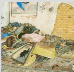
A waste ground